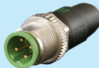
M12 Bus termination (B-coded) IP67