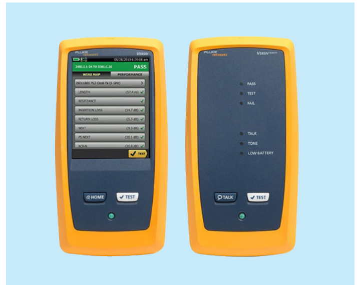
Cable tester ETHERtest V5.3