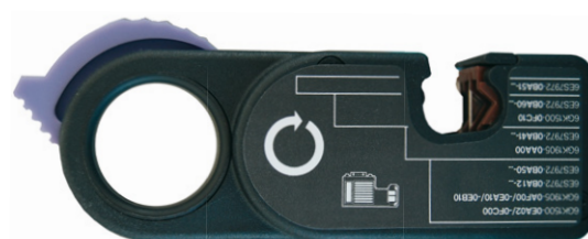
PROFIBUS Fast Connect Stripping Tool