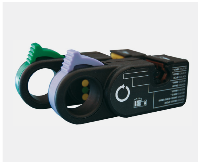
Stripping Tools (PROFIBUS and Ethernet)