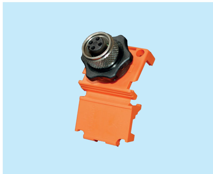
Active measuring point ASiMA