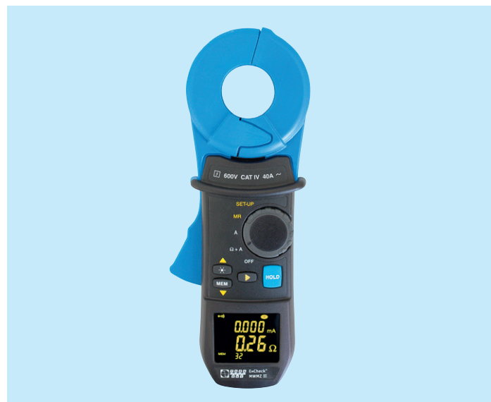
EmCheck® MWMZ II