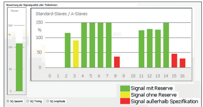
Evaluation of the signal quality for all devices